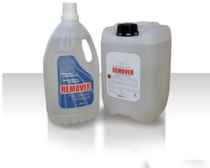
5 and 10 litre packs